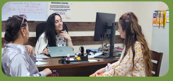
Special counselling for women in the MRC Tajikistan