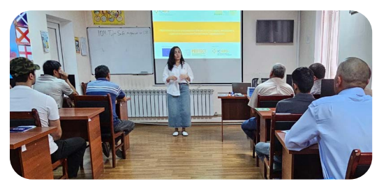
Group counselling by MRC Tajikistan at the Pre-departure centre of Migration Service

MRCs offer a wide range of services to migrants seeking regular and legal migration pathways. These services often include providing information and guidance on legal migration options, assisting with visa applications, offering legal advice and support, facilitating language and cultural orientation programs, and referring migrants to other support services