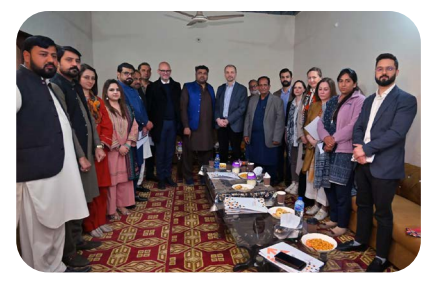
EU Delegation visit to Gujrat