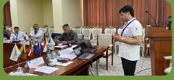
Outreach session in Khujand with the staff of MoLMEP

In November 2023, MRC in Tajikistan reopened in the premises of Migration Service in Dushanbe. The MRC in Dushanbe works closely with individuals interested in migration and provides accurate and timely information to potential migrants to enable them to make informed decision on their migration plan. The MRC is fully engaged in the provision of counselling and pre-departure preparations with potential migrants on a plethora of themes such as seasonal work in the UK, new amendments in the law of Russia on migration, response to the recent terrorist attack in Moscow, Private Employment Agencies – actives ones and the ones in black list, preparation for recruitment to South Korea through Employment Permit System (EPS), extremism and terrorism, human trafficking, benefits of organised recruitment overseas, etc.